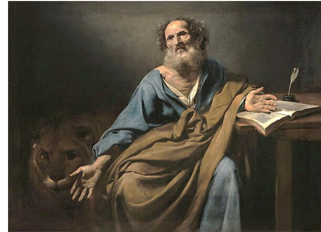
Saint Mark the Evangelist Feast Day April 25th